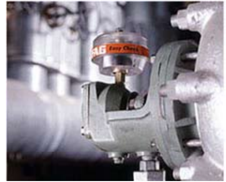
Figure 2: Entry level monitoring device installed on a pump

Various strategies are employed based on how critical a piece of equipment is to the plant and how much detailed analysis is required. An entry level monitoring device such as shown in Figure 2 is mounted on a pump, motor, fan, etc. and continuously monitors the vibration of the equipment and triggers an alarm when it has exceeded the set point. This type of device requires little knowledge of vibration analysis and is easy to implement. However it does not allow for any analysis capabilities.