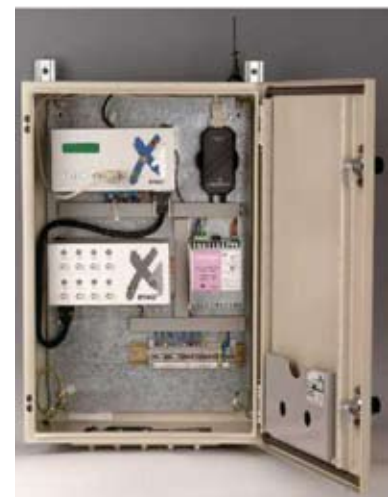
Figure 4: Online condition monitoring system

For more critical equipment, online condition monitoring equipment is preferable. These online condition monitoring units continuously monitor the vibration as well as other process variables, to trend the condition of the equipment and assist in determining when it should be removed from service for repair. They run as a stand alone device and periodically transfer the measured data to a storage computer. Should an alarm occur, it automatically triggers an alarm to the plant control system and generates an email message. These systems are capable of automatically communicating through a variety of methods, from Ethernet through GSM modem and allow monitoring of remote locations anywhere in the world.