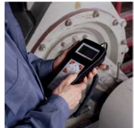
Figure 3: Handheld data collector shown taking a measurement

For plants wishing to have more detailed knowledge of the operational condition of the plant's equipment, a hand held data collector is used. These hand held route based data collectors are used by a vibration technician to collect data from points on the machine. If any of the points exceed the preset alarm limits, an alarm is displayed on the detector. This data is stored in the analysis software database and allows for trending of the readings as well as advanced analysis of the vibration signals.